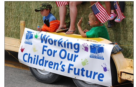
The children of Snake Valley rode in the parade on the GBWN float. Festival proceeds help pay for legal and technical expenses for state and federal lawsuits challenging Nevada State Engineer and Bureau of Land Management decisions. The water fight continues!

Early this year SNWA and the State Engineer filed appeals of that ruling in Nevada Supreme Court. Not long after that appeals process began, both SNWA and the State Engineer appeared to panic about the possibility of their appeals being thrown out in court as premature. As a result, they filed extraordinary petitions seeking to have our District Court victory challenged regardless of how the Supreme Court views their original appeal.