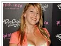
Top 10 Child Stars Who Became Broken Adults