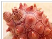
Is Garcinia Cambogia TOO effective at producing weight loss? It's flying off the shelves, get yours!