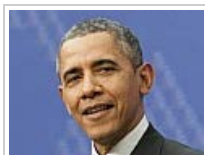
New currency law went into effect July 1st, 2014. [Devastating for Seniors]